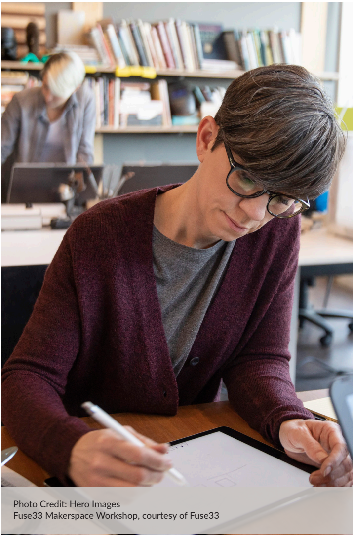
Fuse33 Makerspace Workshop