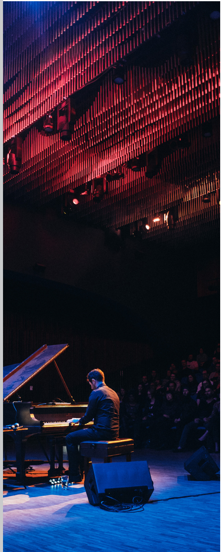
Jean-Michel Blais (2018)