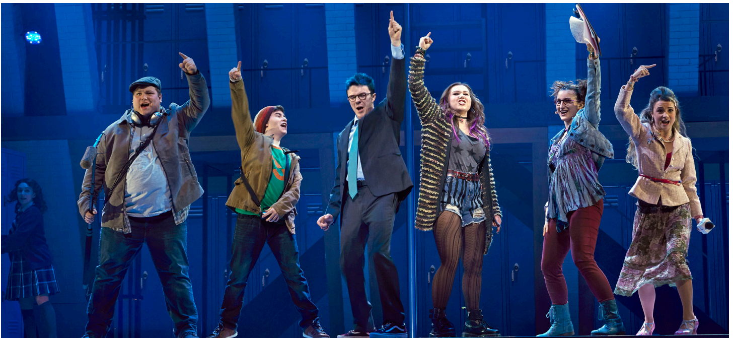
The cast of The Louder We Get, courtesy of Theatre Calgary

We use the UK's National Endowment for Science, Technology and the Arts (Nesta) view of the creative economy, which looks at creativity at the occupational level rather than the industry level. This allows us to gain a more accurate understanding of the economic role creativity plays and allows us to better understand how creativity permeates every industry, whether it is in medicine, oil and gas, or technology.