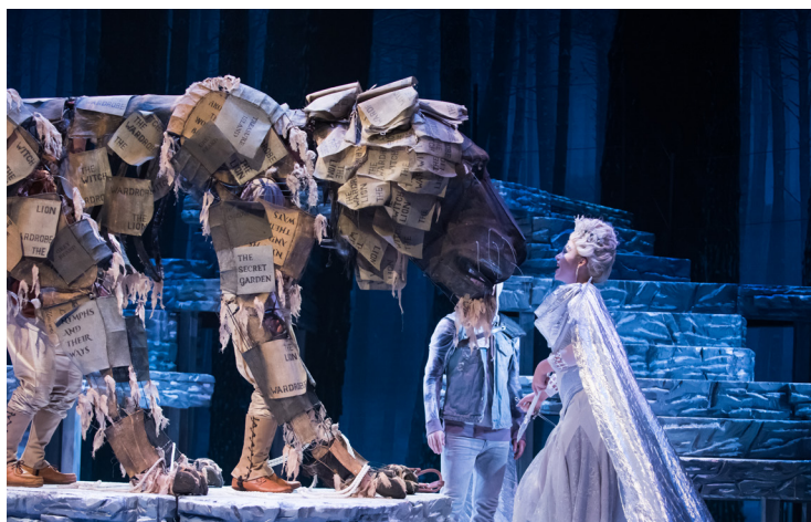
The Lion, the Witch and the Wardrobe (2019)

There is creativity in how we interact with our environment, and it will be a crucial component in achieving environmental sustainability. Mitigating the effects of climate change and sustaining our natural environment will require investment in research and innovation to find creative solutions. The creative economy and creative occupations contribute the designers, communicators, and problem solvers needed to push development in a direction that balances our impact on the environment.